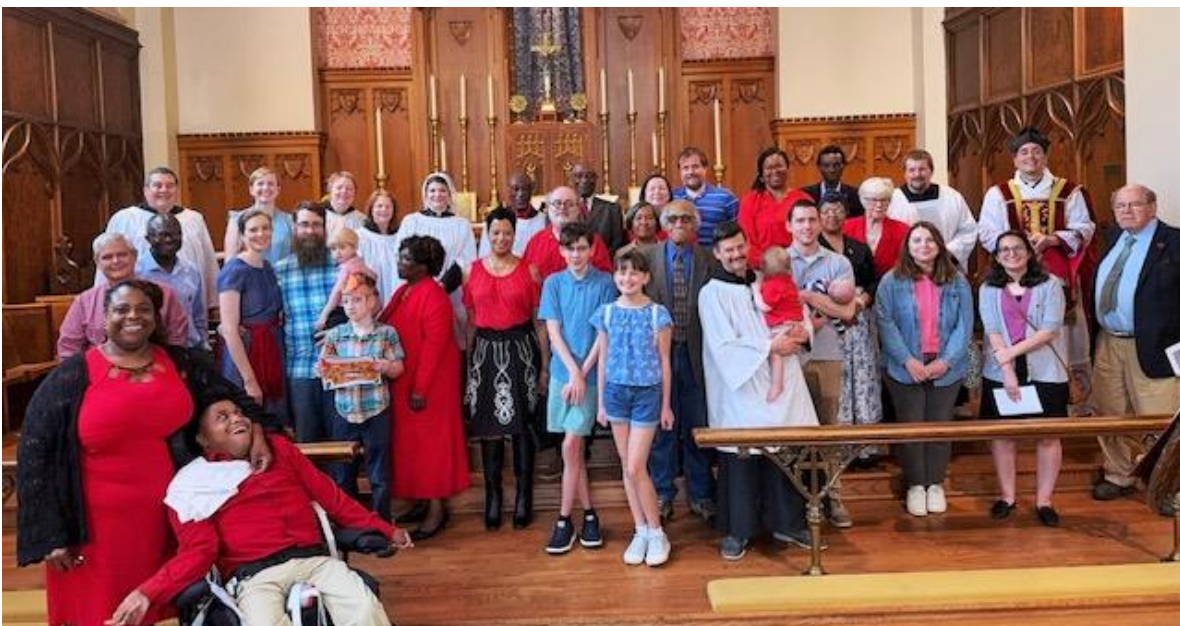
Our 10:30 am Sunday Congregation