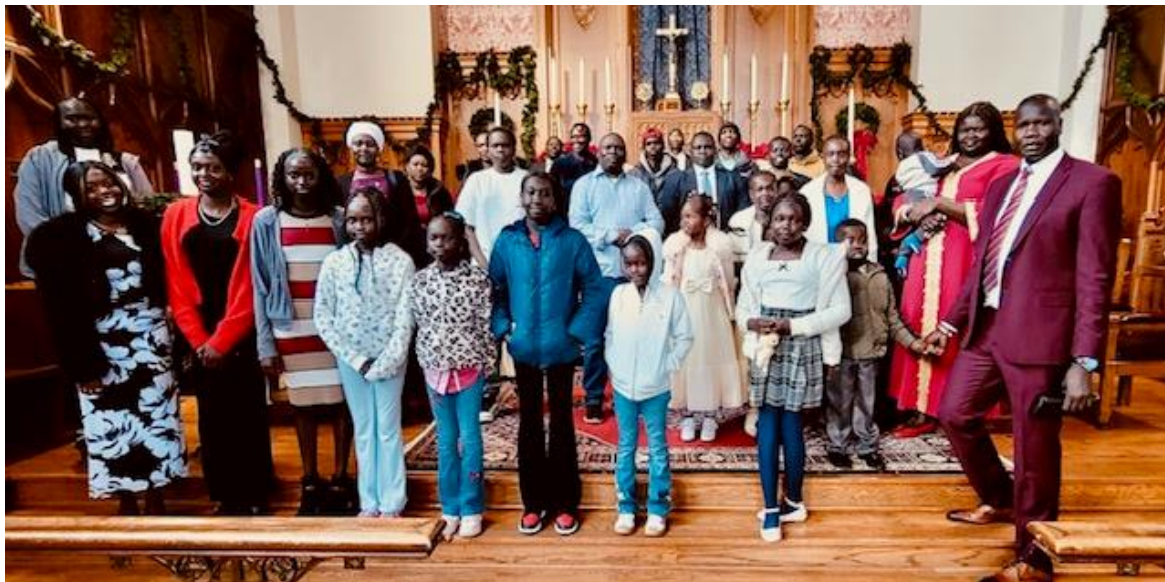
The 12:15 pm Sunday Sudanese Episcopalian Congregation (Our Rector joins them once a month to celebrate Mass.)