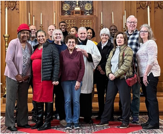
Our 8:00 am Sunday Congregation