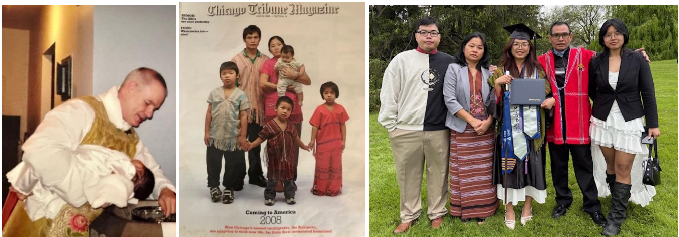
Burmese Refugees (2008-2025)

In the fall of 2007 a group of Karen refugees unexpectedly appeared at St Paul’s for early Mass. They spoke no English but had recognized our Anglican signage having been churched by the British in Burma. What began as an effort to supply 24 sets of gloves and mittens to newcomers who had no conception of a Chicago winter turned into over a decade of intense and loving outreach. Most of our Burmese families are gone now. They have moved to the suburbs or other areas of the country to pursue improved employment opportunities. One of our families remains. The parents’ jobs prevent them from joining us on Sundays but the father continues to take a long bus ride from the suburbs every Thursday night to join us for Mass. Their eldest daughter graduated from Middlebury College in Vermont last spring.