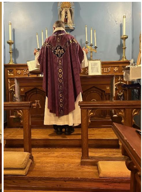
Weekday Masses are held in the Lady Chapel