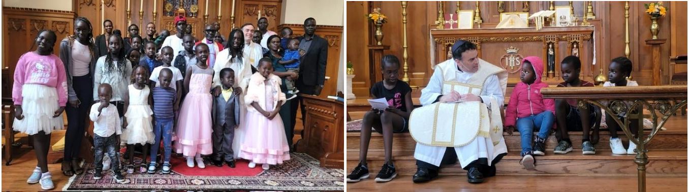
Sudanese Refugees (2025)

Sudanese men began to arrive in Chicago in the late twentieth century after civil war broke out in their home country. By the 2000s, many of the so-called “Lost Boys of Sudan” had settled in Rogers Park and nearby Edgewater, creating an enclave of the strongly Anglican-identifying immigrant families. These were given weekly access to St. Paul’s Church by-the-Lake for group meets. The boys that came to us then are now adults with families. Those who stayed in Chicago return to us on Sundays to congregate and praise God in a Dinkan Prayer Service. Once a month our Rector joins them to celebrate Mass.