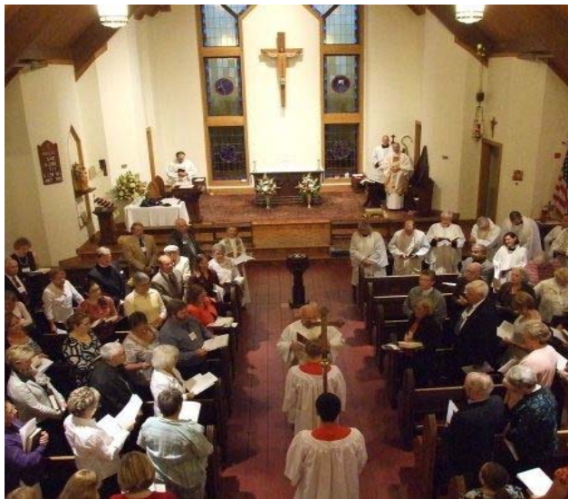
Reflecting Christ's Image through Love, Inclusion & Service