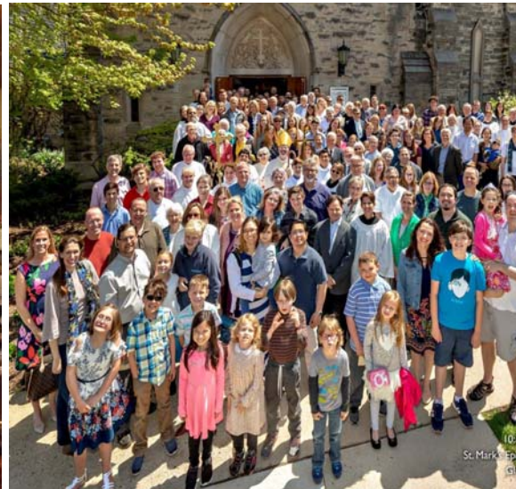
Rooted in Baptism, Growing in Faith, Branching out into the World

Thank you for your interest in learning more about this opportunity to serve the Episcopal communities of Calvary, Lombard and St. Mark's, Glen Ellyn in a newly created position for a full-time priest. Below you will find our vision, information about these churches, and a job description.